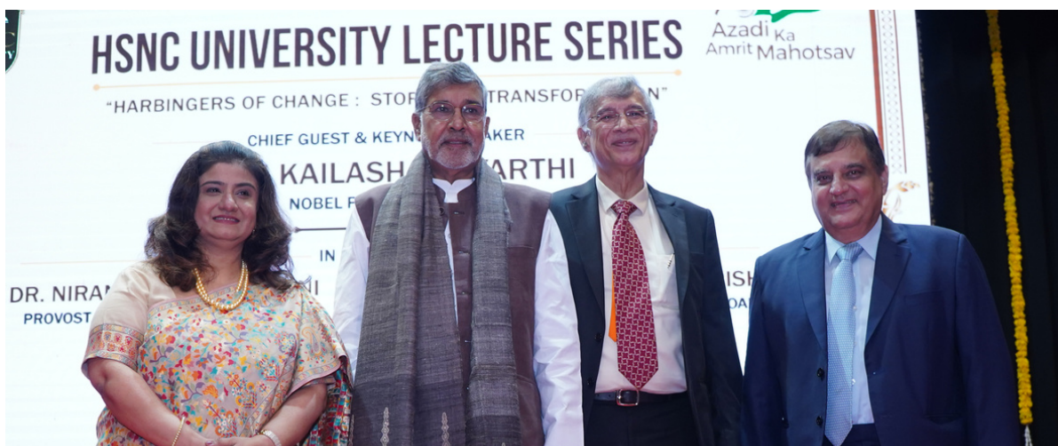
Harbingers of Change: Stories of Transformation Shri Kailash Satyarthi Nobel Peace Prize laureate on 3rd August, 2022 at K.C. College, Mumbai