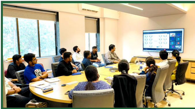
MBA RE students attended a pre-internship talk for internship opportunity at M/s JP Infra (Mumbai) Pvt. Ltd on 28th November 2022 at HSNC University, Mumbai.