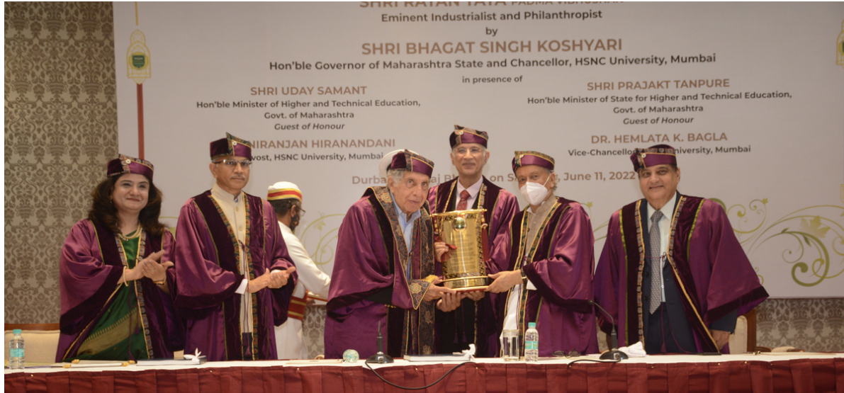
Conferral of Honorary D.Litt. on Shri Ratan Tata Eminent Industrialist and Philanthropist on 11th June, 2022 at Durbar Hall, Raj Bhavan, Mumbai.