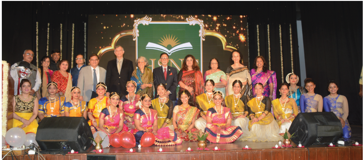
Ghungroo Saga event - launch of School of Performing Arts on 10.12.2021 at K.C. College, Mumbai