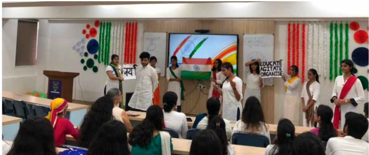
Play for Azadi ka Amrut Mahotsav - Theatre Workshop at School of Performing Arts on 15.08.2022 at HSNC University, Mumbai