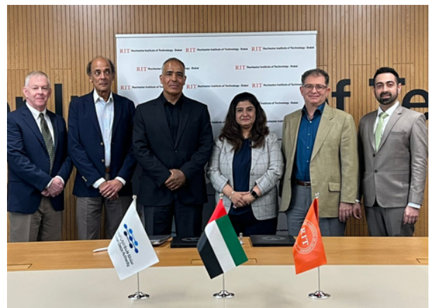
MoU Signing with Rochester Institute of Technology Dubai on 12.07,20222 at Rochester Institute of Technology, Dubai