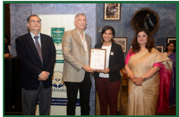
NAREDCO Leadership Development Programme Certificate Distribution at Meluha The Fern, Powai on 15th October, 2022