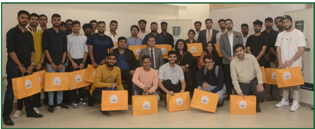
Orientation Program for the MBA Batch of 2022-24 on 29th July 2022 at HSNC University, Mumbai.