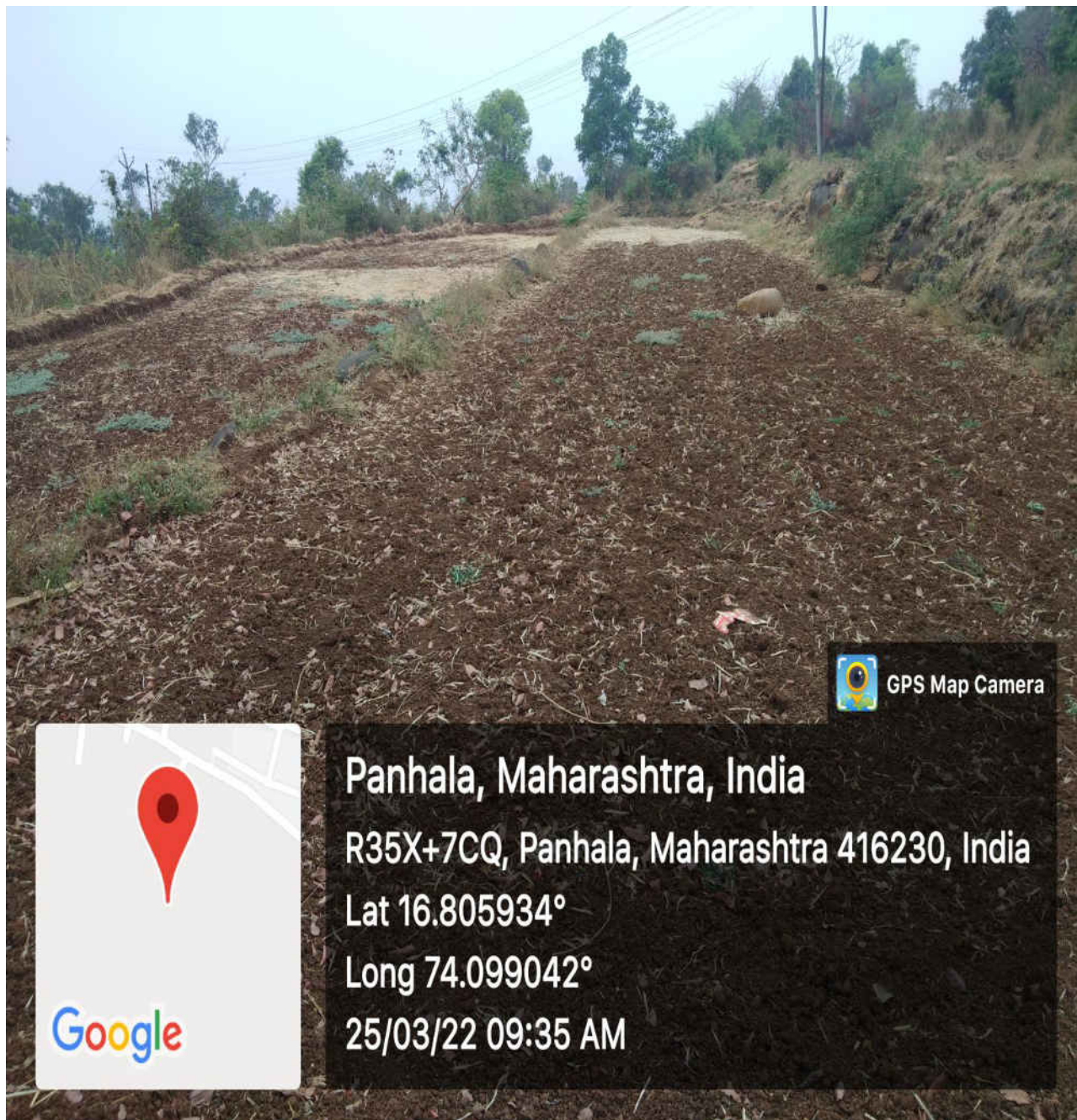
Photograph – Waste water conveyed to horse feed farm