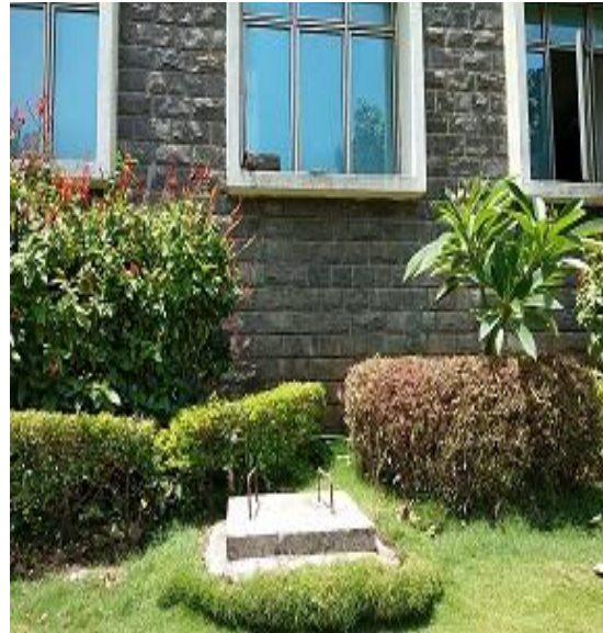
Rainwater harvesting pipe chamber